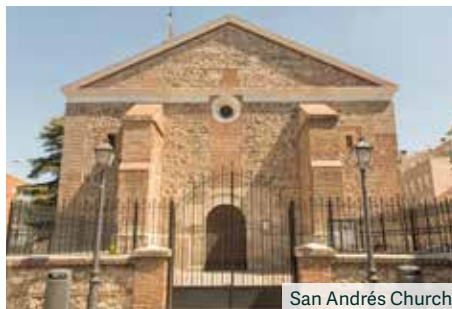
San Andrés Church