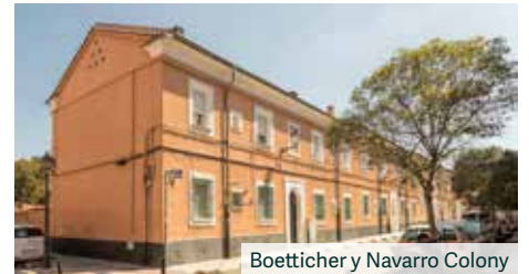
Boetticher y Navarro Colony

The district's old quarter consists of a handful of quiet streets surrounding a Plaza Mayor , or Main Square, which is similar to those seen in so many Castilian towns. The names of its sites reflect a rural past: Palomares ('Dovecote'), Huerta de Villaverde ('Villaverde Orchard') and Parvillas, which was the name for the grain harvest that was spread out on the threshing floor for threshing. Very nearby, in the tree-lined Paseo de Alberto Palacios, is the Municipal Market , where you can find top-quality fresh produce, as well as San Andrés Church , featuring distinctive walls with Toledo-style bonding. Right next to the centre of town is the Boetticher y Navarro Colony , a cluster of identical houses built in 1957 for workers at the factory with the same name, which we will describe in further detail below.