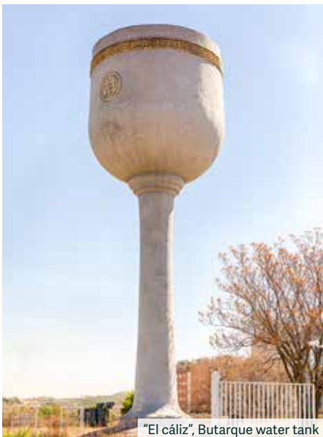
"El cáliz", Butarque water tank

The Neo-Mudéjar pavilions of Villaverde Bajo, the train tracks that criss-cross the district in every direction, the Butarque water tank nicknamed 'el cáliz' (the chalice) and the brick chimney located in Paseo de María Droc all attest to the industrial past of the south of Madrid. One of the most eye-catching of these landmarks is La N@ve , a spectacular reinforced concrete constructed as the former Boetticher y Navarro factory, which specialised in the production of lifts, escalators, turbines and sluices. Today, after being remodelled by Ch+Qs architectural firm, it houses a centre for inspiration, education and open innovation where societal stakeholders (citizens, entrepreneurs, companies, SMEs, students, universities, etc.) come together. In 2017 it will host the World Forum on Urban Violence and Education for Coexistence and Peace.