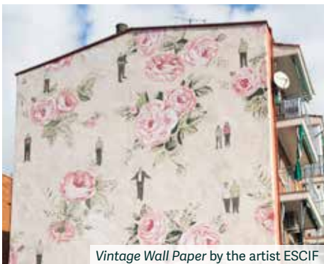
Vintage Wall Paper by the artist ESCIF